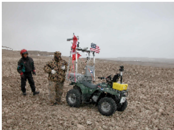
Figure 1. Human-operated simulated 2015-class rover at Houghton Crater, Devon Island, Canada.

When considering the future capabilities of robotic missions compared with potential human planetary missions, the relevant timeframe is 10-20 years in the future. Field testing with a current-generation rover such as Nomad [8] or K9 [9] would build-in the limitations and constraints of today’s state-of-the-art – not a fair representation of 2015-class robotic exploration systems. Therefore, in this study, it was decided to remotely control a 2015-class rover-equivalent, which was simulated with a modified human-driven all-terrain vehicle, shown in Figure 1 with installed panoramic and targeted imaging capabilities.