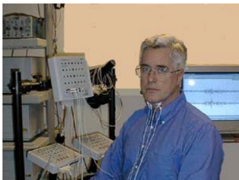
Fig 1: Electrode placement and recording

EMG and EPG signal data was collected for each of the subjects using two pairs of self-adhesive AG/AG-Cl electrodes. They were located on the left and right anterior area of the throat approximately .25 cm back from the chin cleft and 1- 1/2 cm from the right and left side of the larynx (Figure 1). Initial results indicated that as few as one electrode pair located diagonally between the cleft of the chin and the larynx would suffice for small sets of discrete word recognition. Signal grounding required an additional electrode attached to the right wrist. When acquiring data using the wet electrodes, each electrode pair was connected to a commercial Neuroscan signal recorder which recorded the EMG responses sampled at 2000 Hz. A 60 hertz notch filter was used to remove ambient interference.