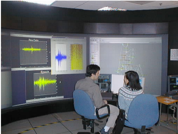
Fig. 2 Real Time Display Environment